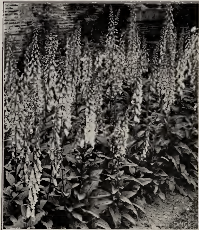
DIGITALIS GIANT SHIRLEY HYBRIDS

*Meadia (Shooting Star). A pretty perennial, with rose-colored or sometimes white flowers in May or June, on 8 to 10 in. stems. This is sometimes called "American Cyclamen." It thrives in rich, moist woods in the open border or rock garden. 25c. each, $1.80 per 10, $12.00 per 100.